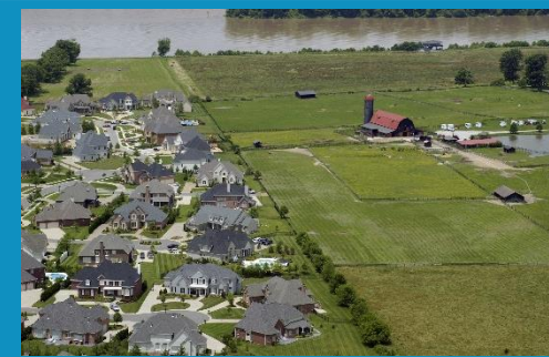
Protection of farmland