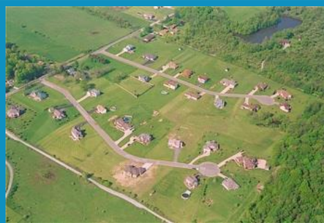
Large individual lots