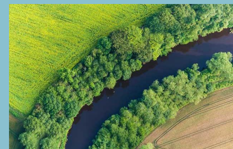
Green buffer by water or roads