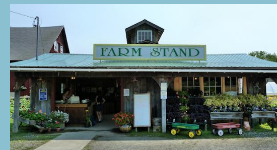
Small Roadside stands

How would you feel about the following elements in the agricultural district?